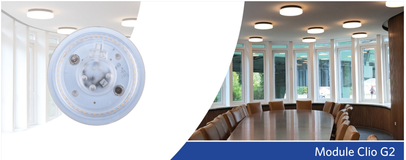
Module Clio G2