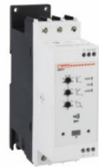
Soft starter advanced ADXNP Asynchronous three phase