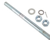
545098003200 LEDHighbay-Pole and Adapter

Highbay Pole and Adapter (545098003200) is only compatible with 80W and 110W versions. Highbay Pole (545098003900) is only compatible with 150W, 200W and 220W versions.